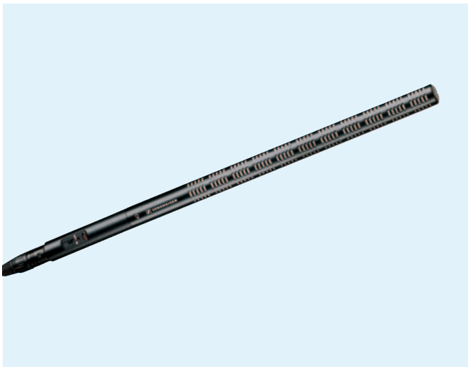
Pictured with K6 powering module and cable (available separately)

The ME 67 is a long gun microphone head designed for use with the K6 and K6P powering modules. A highly directional microphone, it can be used where the microphone must be placed at a distance from the sound source. Matt black, anodised, scratch-resistant finish.