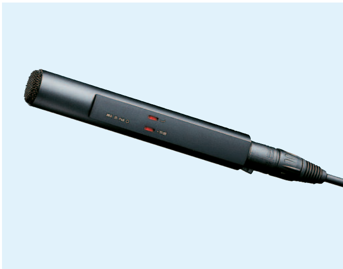
Cable pictured is an accessory not supplied with the microphone

The omni-directional MKH 20 is usually used as a main microphone for orchestras and solo instruments, and picks up the natural acoustics of the room, though it does have a much wider range of applications as omni-directional microphones do not suffer from 'proximity effect'.