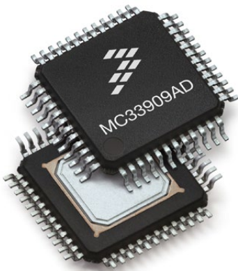
48 LQFP-EP 98ASA00737D

Expanding on more than 30 years of innovation, Freescale is a leading provider of high-performance products that use SMARTMOS technology combining digital, power and standard analog functions. Freescale supplies analog and power management ICs that are advancing the automotive, consumer, industrial and networking markets. Analog solutions interface with real-world signals to control and drive for complete embedded systems.